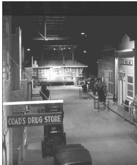
Western Development Museum